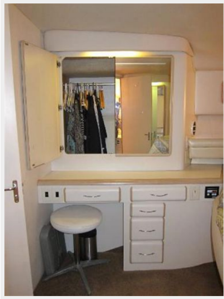
Master Stateroom Vanity to Port