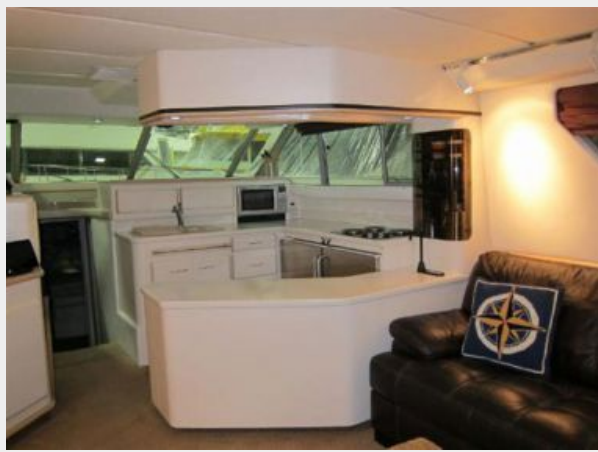
Galley/Salon Looking Forward