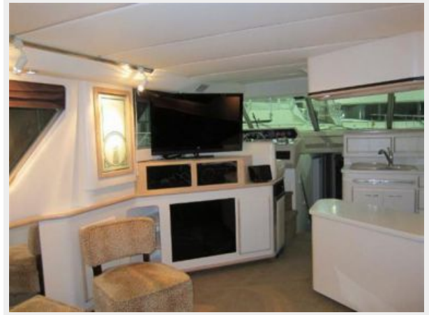
Entertainment Center Port side