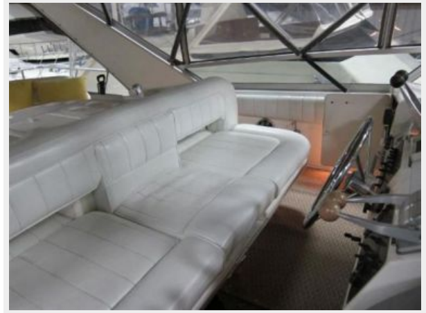
Flybridge Helm Seating