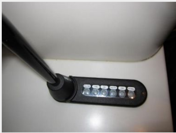
SideBar Fluid Dispenser