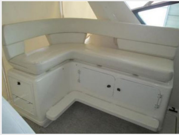
L Bench seat