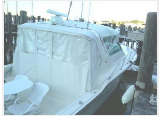
Custom Drop Curtain