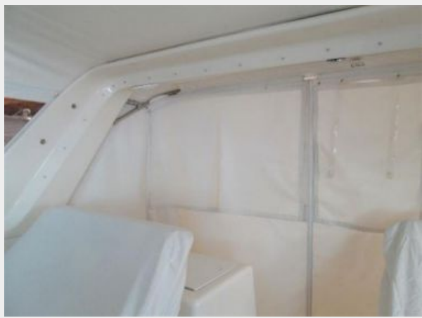
Inside View Custom Drop Curtain