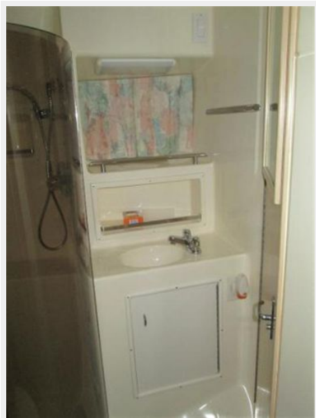
Head with Seperate Shower