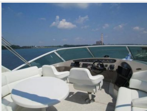
Flybridge Seating and Helm