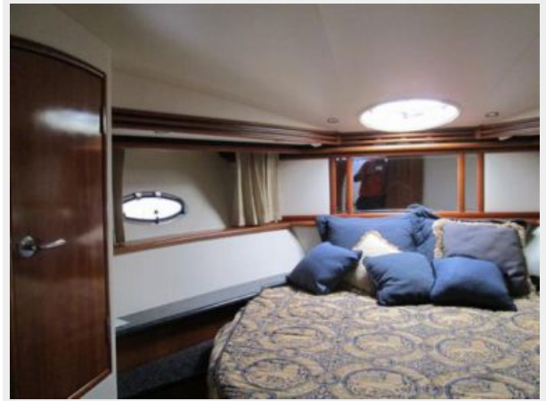
Forward Berth with Opening Port