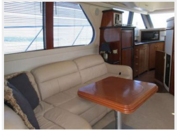
Salon Port from Aft Facing Forward