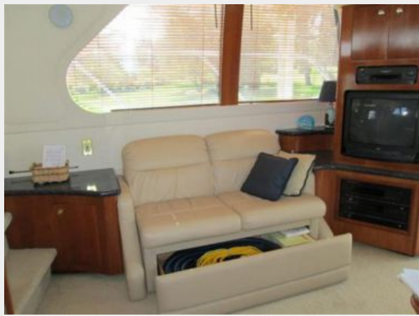
Salon Seating with Storage Stb. side