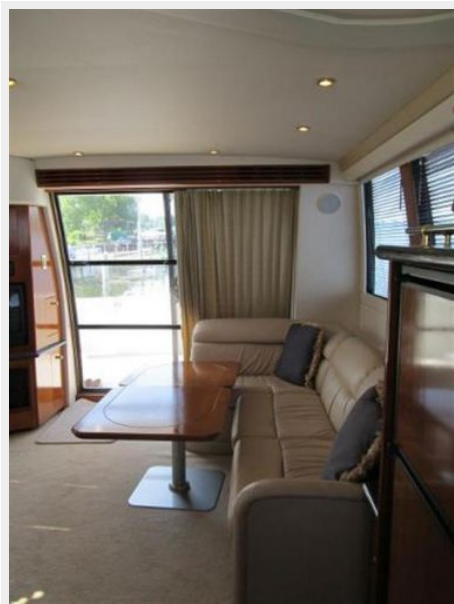
Port Salon Seating with Table Facing aft