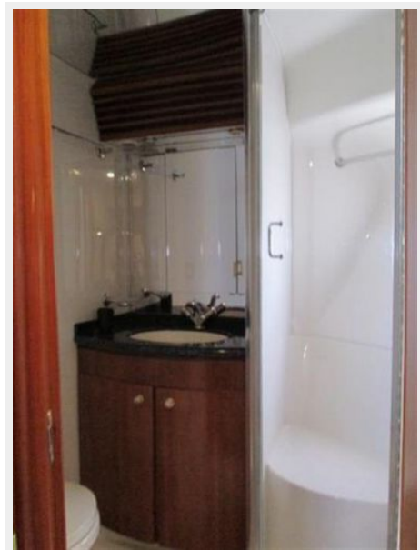
Master Head with Shower and Vanity