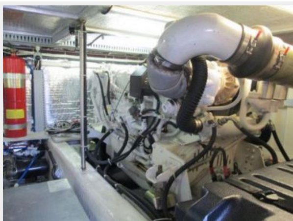
Starboard Volvo T-74P Engine