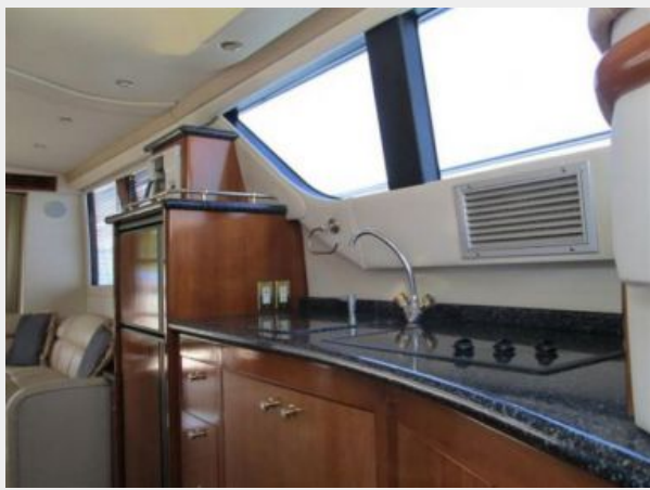
Galley from Forward Facing Aft