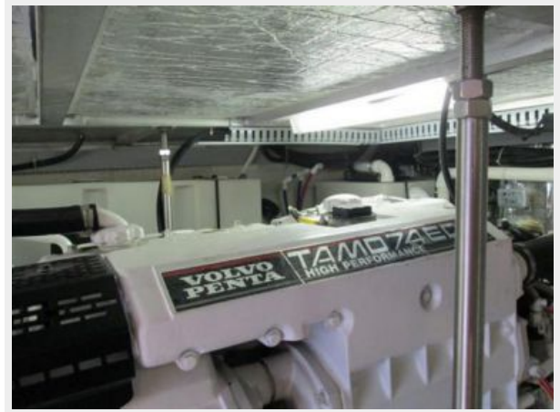
Port Volvo T-74P Engine