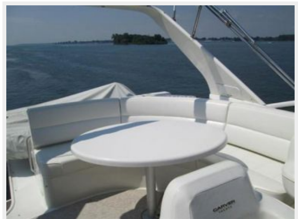
Flybridge Bench Seating and Table