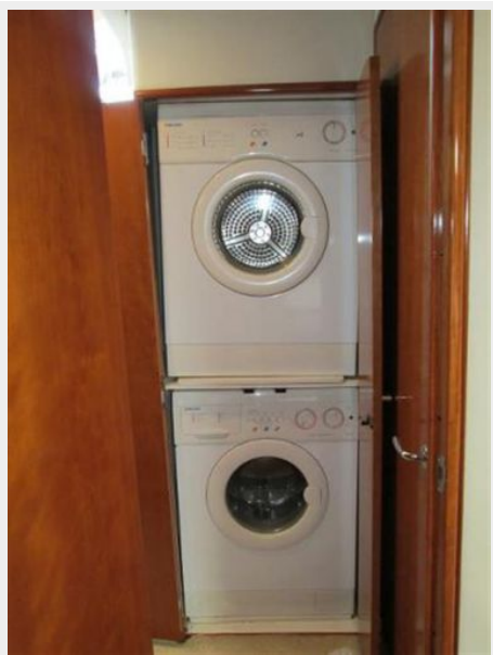
Washer and Dryer