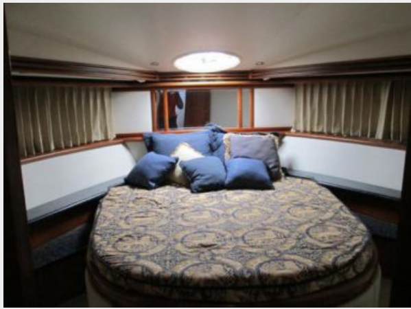
Forward Queen Berth