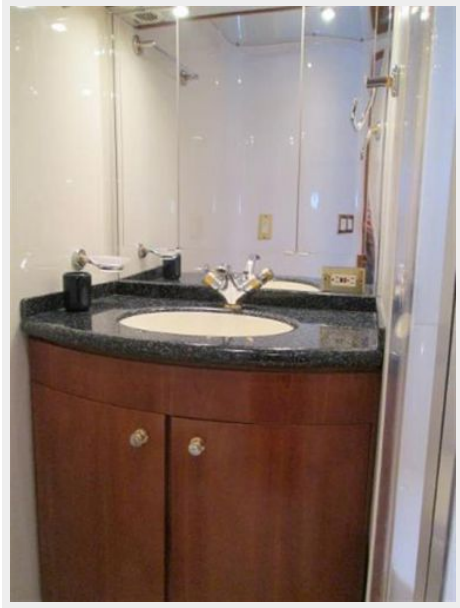
Master Vanity W/ sink and Mirror