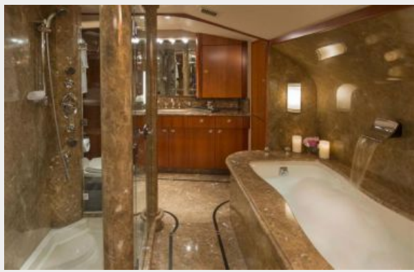
His and Her Master Bath