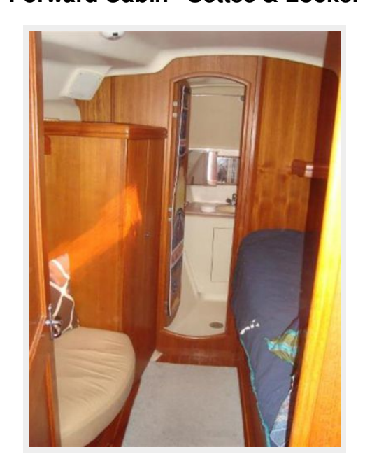
Forward Cabin - Settee & Locker