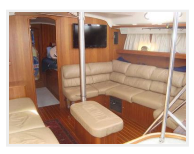
Salon with Table Raised