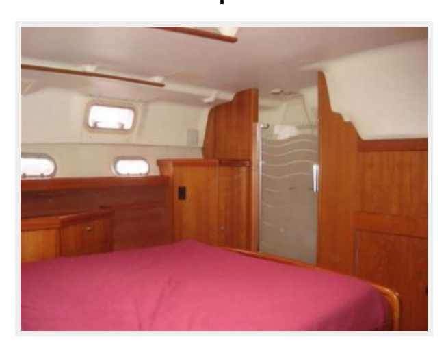
Aft Cabin - Separate Shower