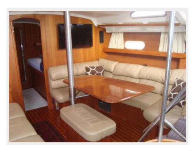
Salon - Starbd Side