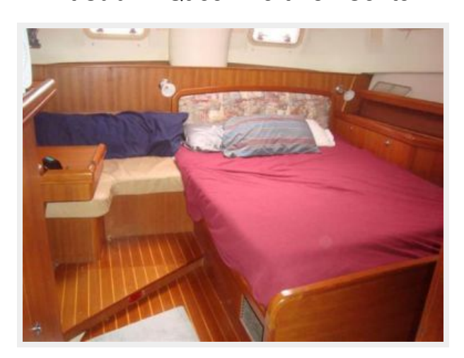
Aft Cabin - Queen Berth on Center