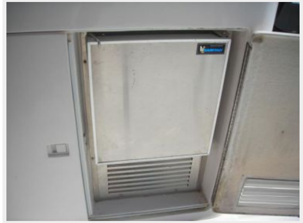
Cockpit ice maker