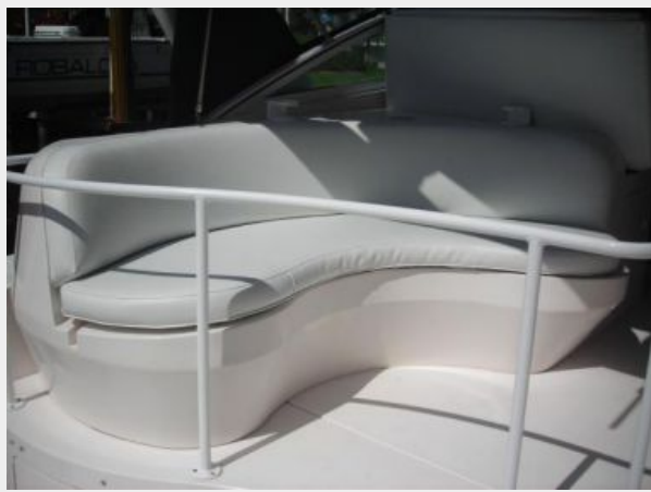
Aft cockpit seating