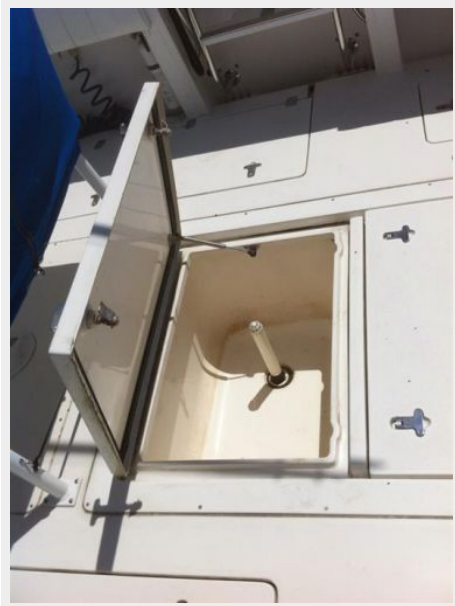
Aft in deck livewell