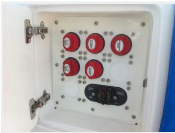
Battery selector switches