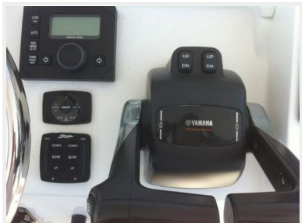
Console, throttles, trim tabs, Simrad auto pilot