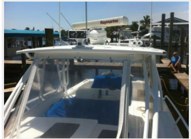
Hard top, radar, antennas, ACR remote control search light