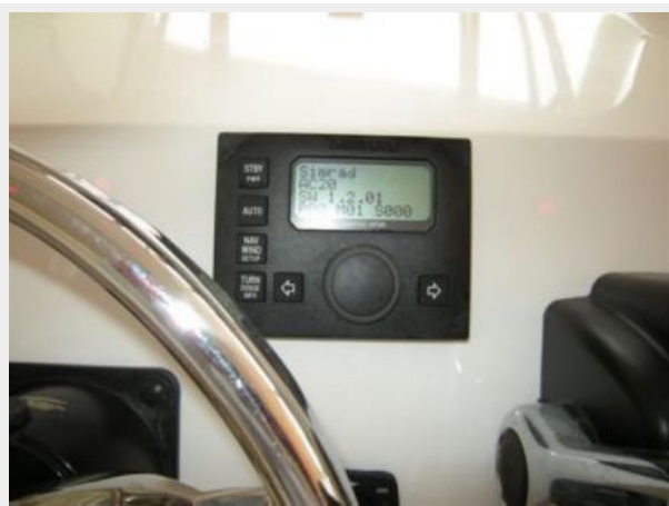
Console, Simrad auto pilot