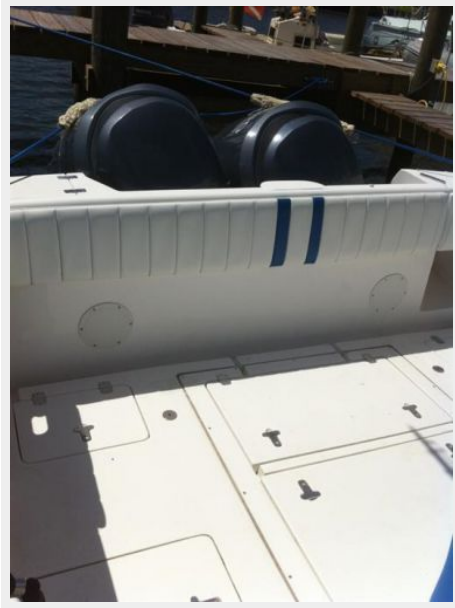
Aft deck, transom, coaming pads