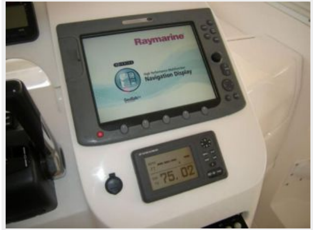
Console Raymarine E120 display, Furuno digital depth display