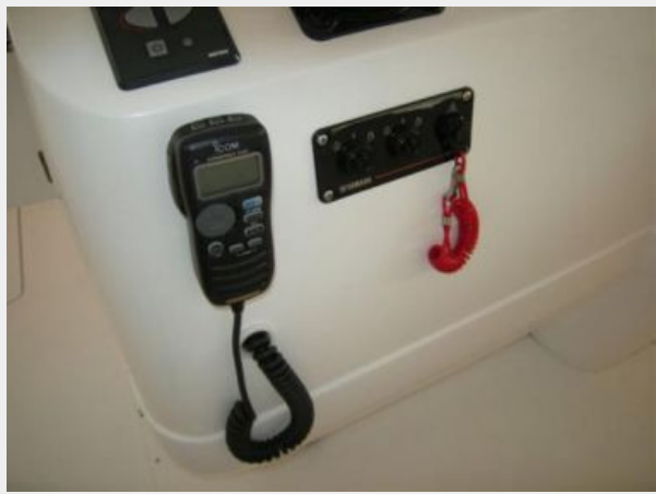
Console, VHF, ignition and kill switches