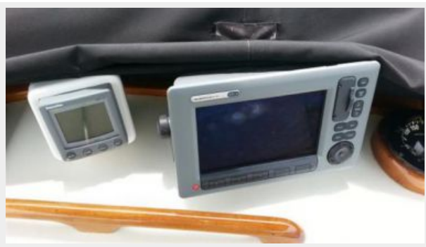
Bridge Helm Electronics