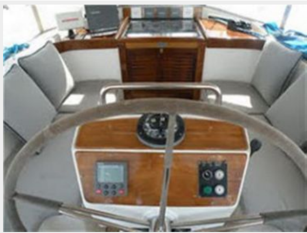
Hallberg Rassy 46 - Steering pedestal