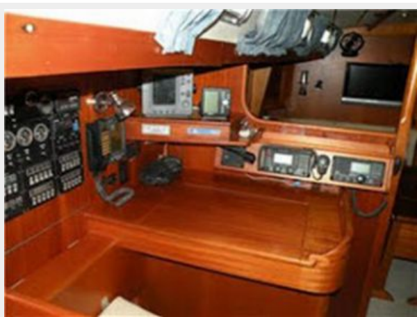
Hallberg Rassy 46 - Nav Desk