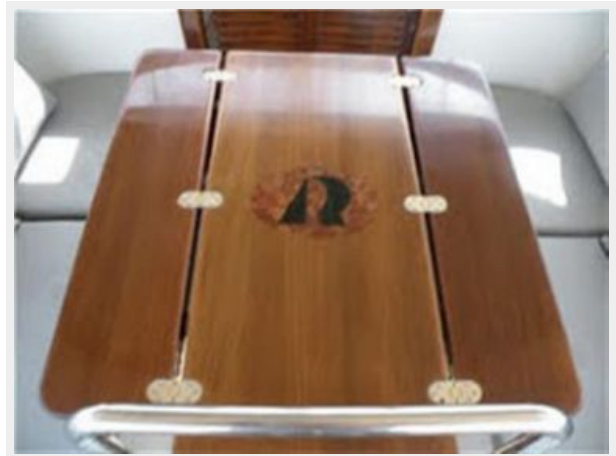
Hallberg Rassy 46 - Cockpit Table with HR logo