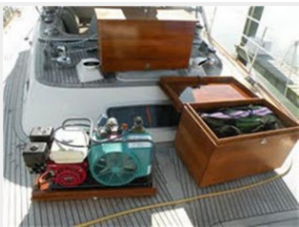
Hallberg Rassy 46 - Dive gear