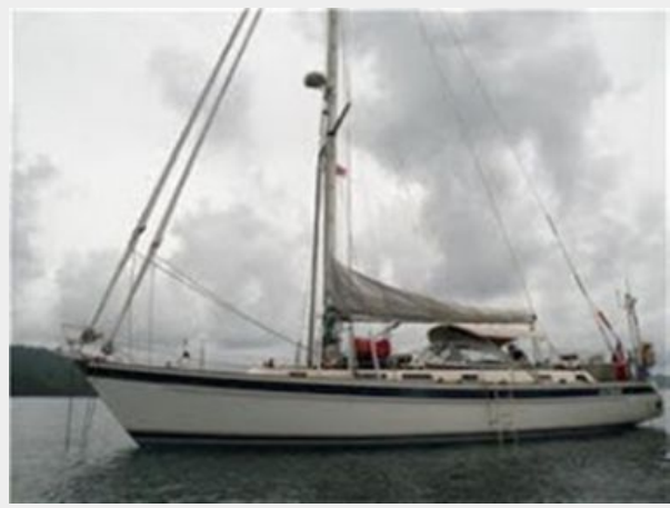
Hallberg Rassy 46 - On the hook