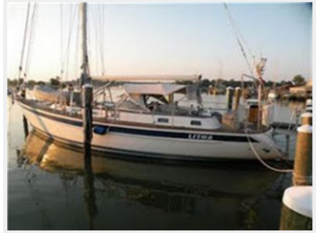
Hallberg Rassy 46 - At the dock