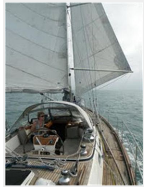
Hallberg Rassy 46 - Under way