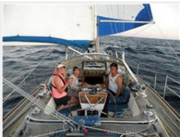
Hallberg Rassy 46 - Happy crew at sea