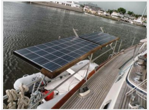
Hallberg Rassy 46 - Solar Panels deployed