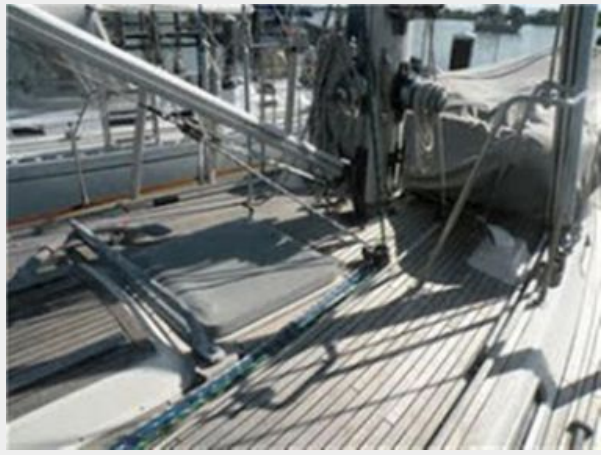
Hallberg Rassy 46 - Mast Step