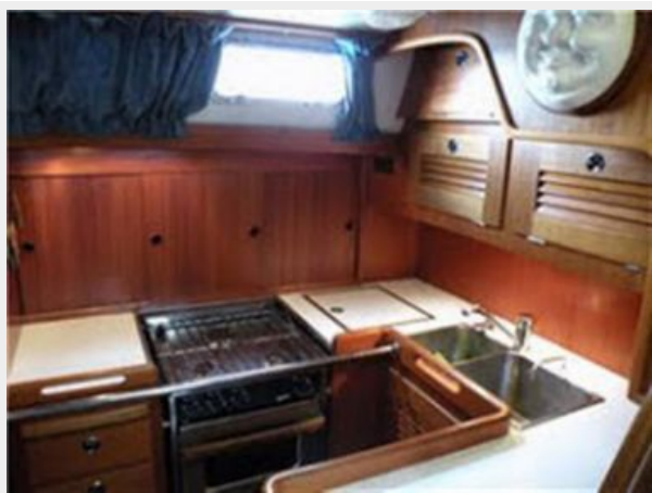
Hallberg Rassy 46 - Galley counter