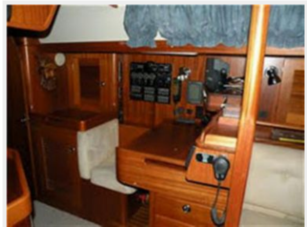
Hallberg Rassy 46 - Nav Area