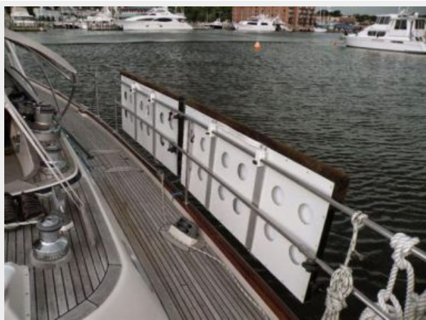
Hallberg Rassy 46 - Solar Panels stored