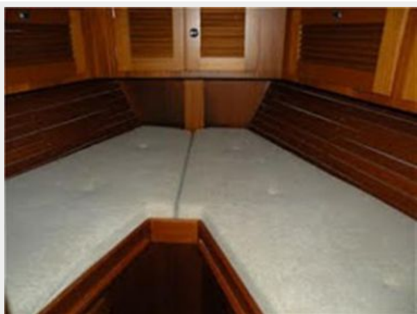
Hallberg Rassy 46 - Forward Berth