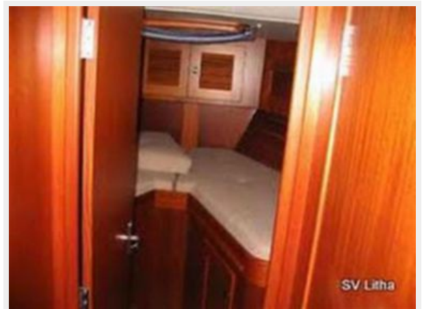
Hallberg Rassy 46 - Forward Cabin