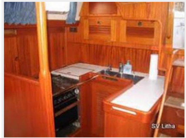
Hallberg Rassy 46 - Galley