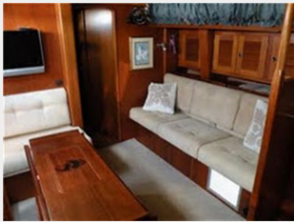
Hallberg Rassy 46 - Main Salon looking aft