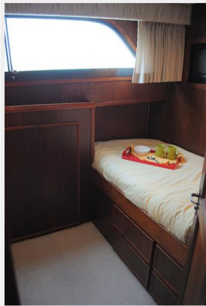
Guest Cabin 1