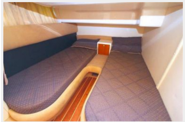
guest state room