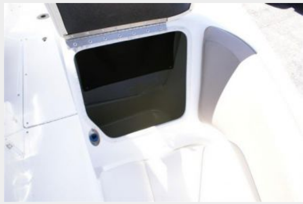
Storage Under Passenger Console