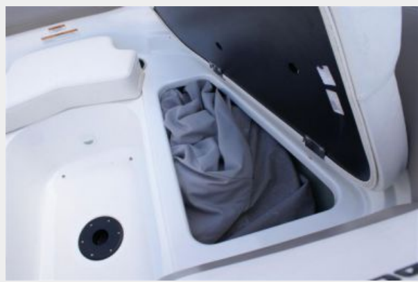
Storage Under Front Seats