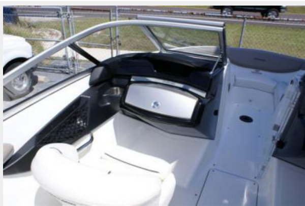
Companion Seat & Glovebox