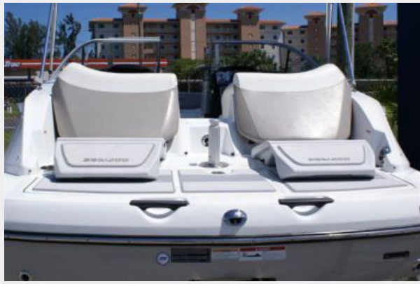
Transat Seats Folded Out