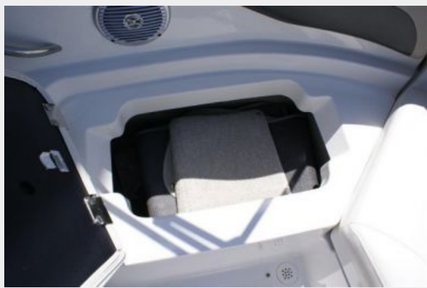
Storage Under Rear Seats