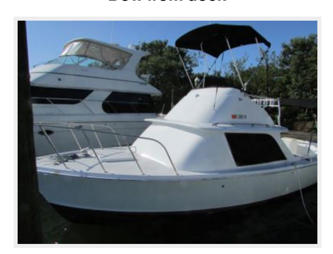
Bow from dock