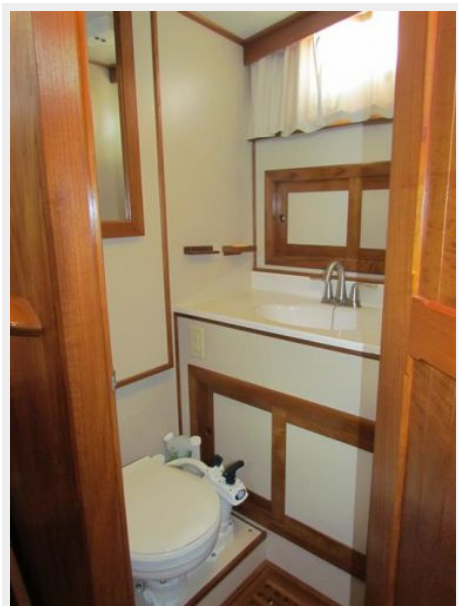
Forwrd Guest Head