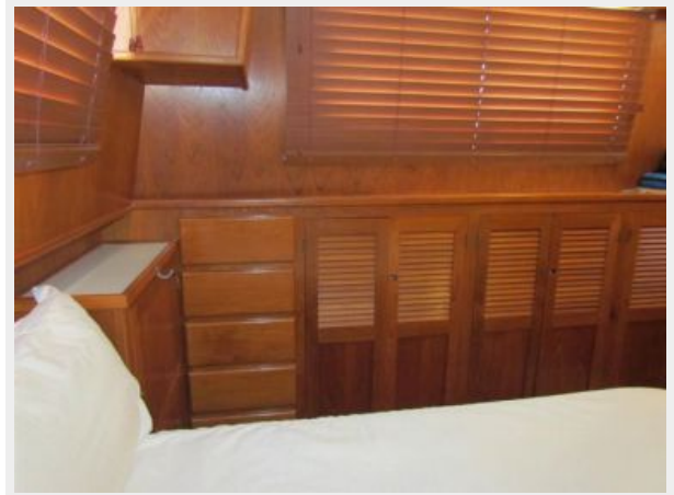
Master Stateroom Hanging Lockers