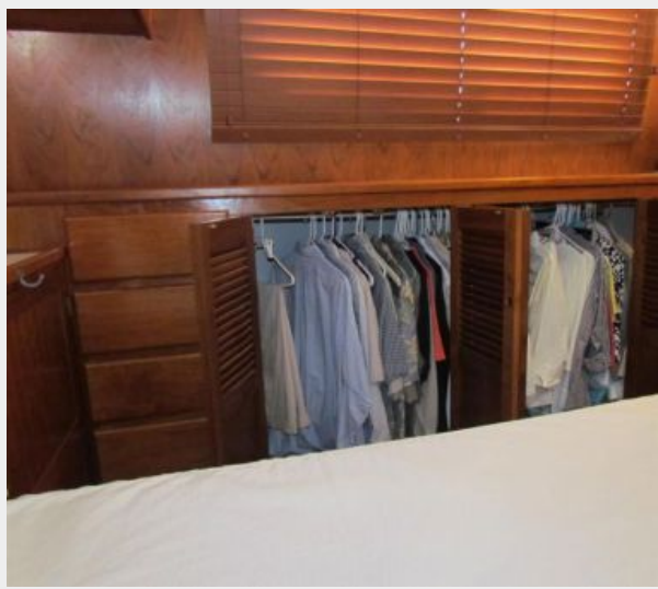
Master Stateroom Locker Open