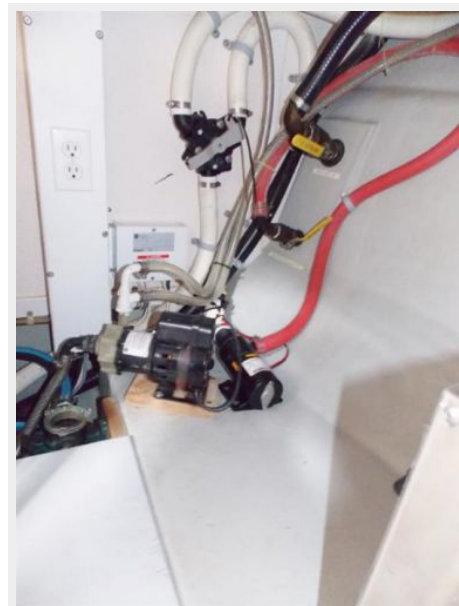
Clean Engine Room