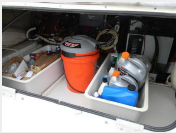
Storage behind Bow Seat