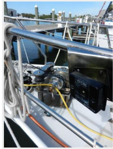
Double SS rails all around