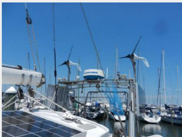
Wind generator, radar