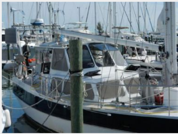
At the dock