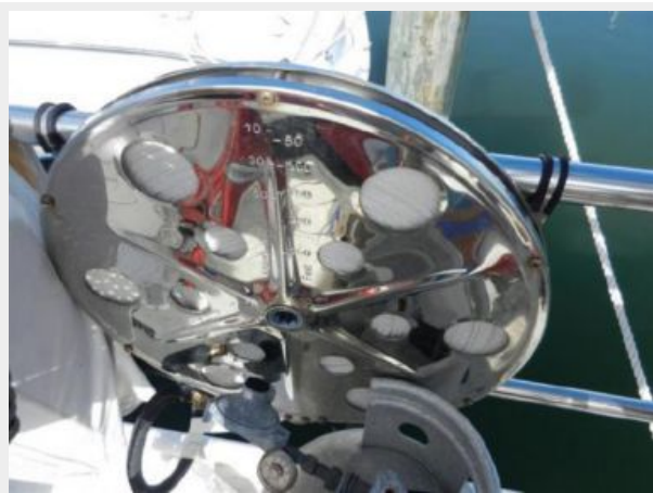
Jacklines in SS mounted case