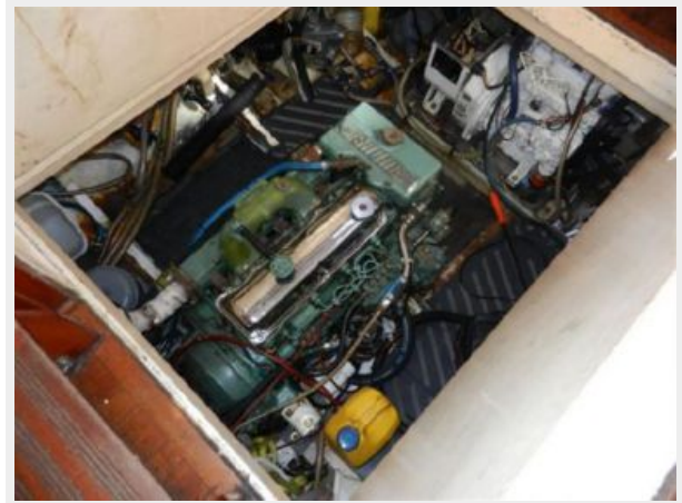
Engine access under floor boards