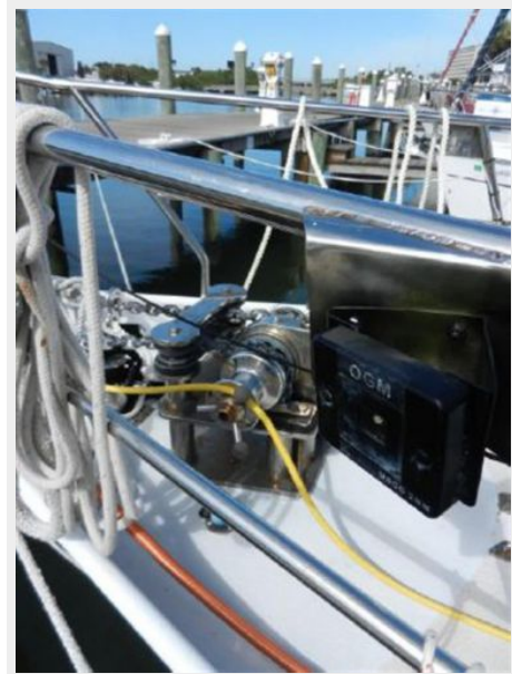
Double SS rails all around