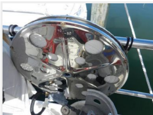
Jacklines in SS mounted case