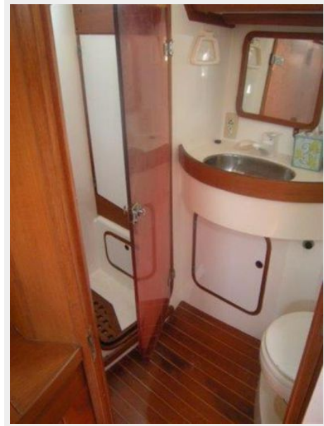
Head and Shower