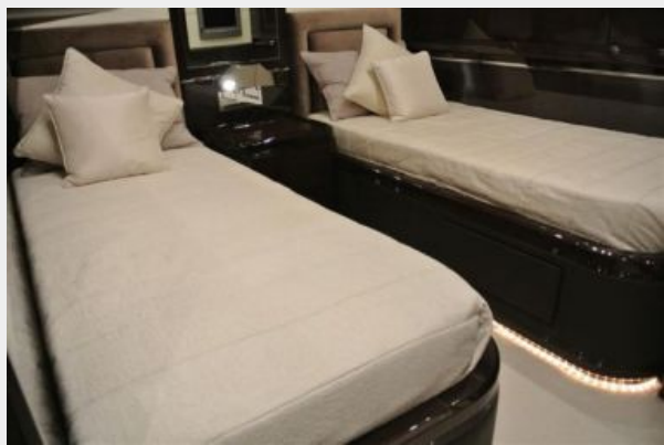
Guest Cabin 2