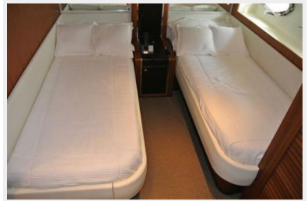
Guest Cabin 2