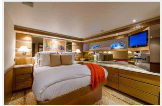
Starboard Guest Stateroom