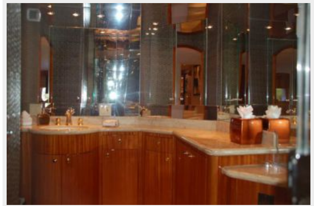
Master his/hers head