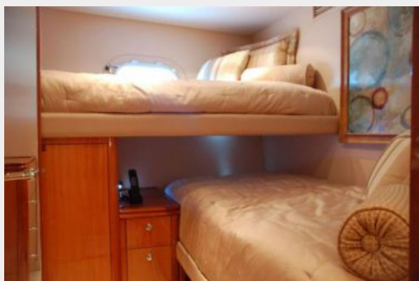
Guest twin stateroom