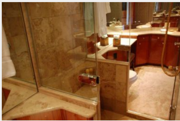
Marble master shower