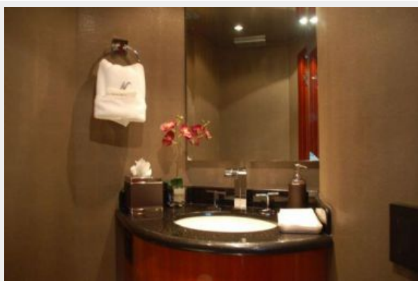
On-deck day head