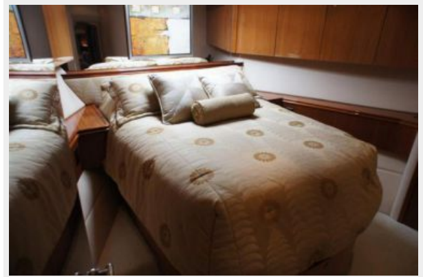
Forward VIP stateroom