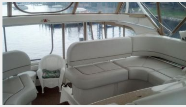
Upper deck seating