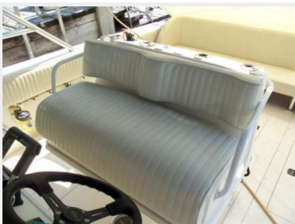
Electric Helm Seat