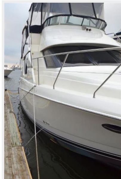
Fresh Wax June 2