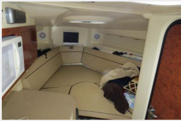
Triton 351 Express Cabin Forward