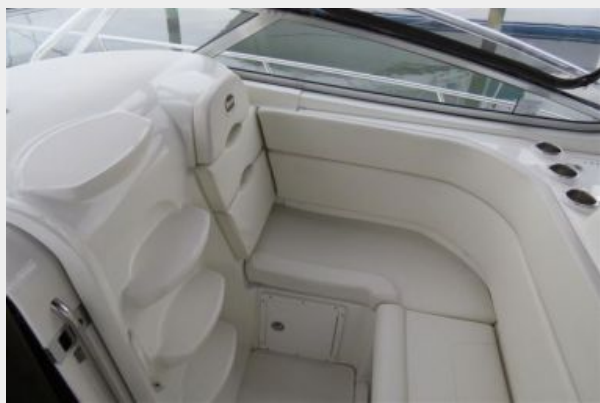
Triton 351 Express Forward Helm Seating