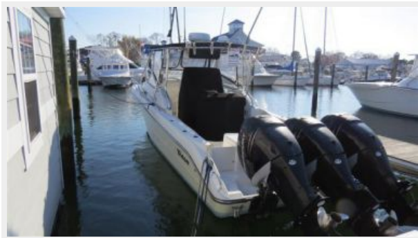
Triton 351 Express Helm Covers & Full Canvas