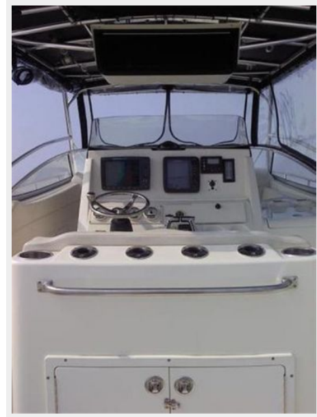
Triton 351 Express Helm