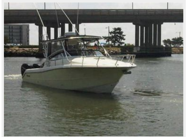
Triton 351 Express Front Profile