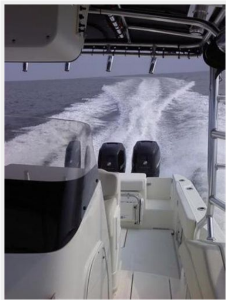
Triton 351 Running