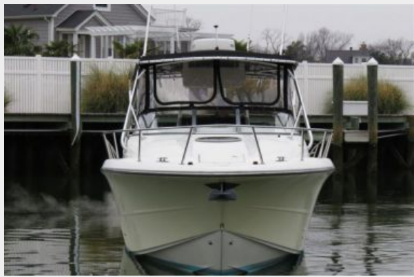
Triton 351 Express Bow