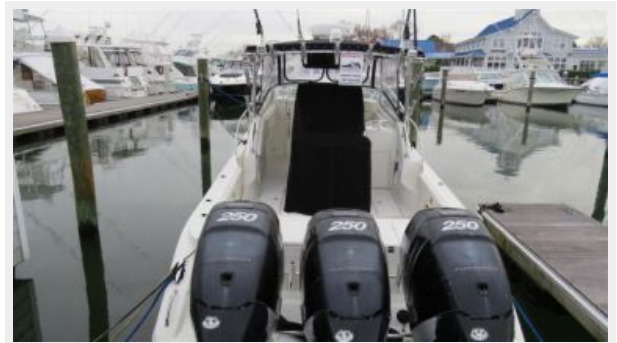
Triton 351 Express Helm Seat Cover