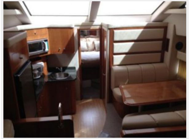
Large Galley and Settee