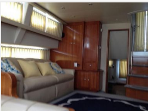
Starboard Salon Seating