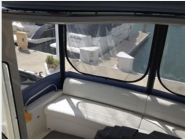
Aft Deck Starboard Seating