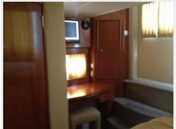
Aft Stateroom desk