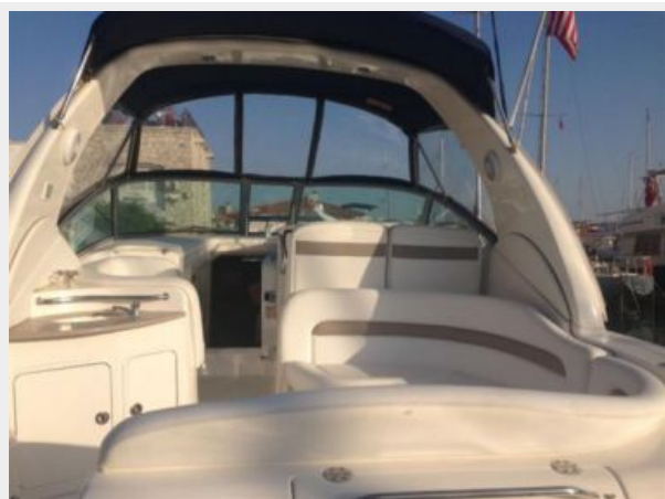
Sea Ray 355 Sundancer