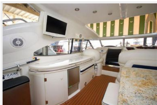
Wet Bar and TV Cockpit