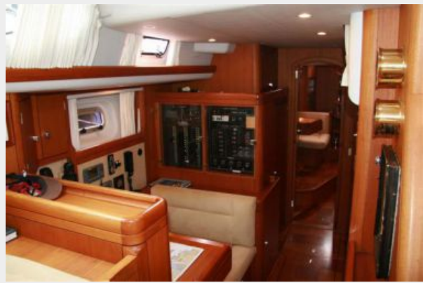
Nav Station, Aft Passageway