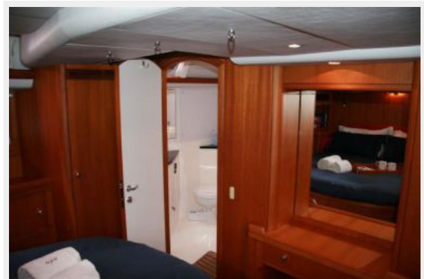
Master Stateroom, Fwd.