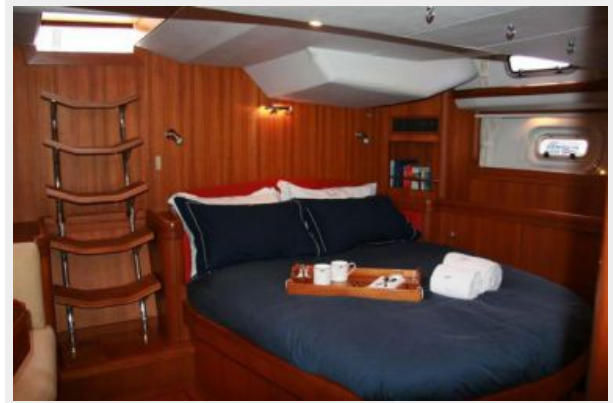
Master Stateroom, Aft