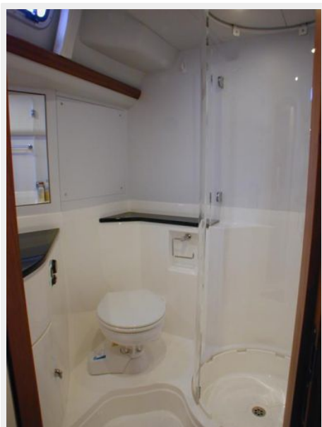
Master En Suite Head