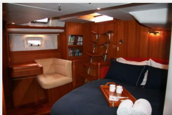
Master Stateroom, Stbd. Side