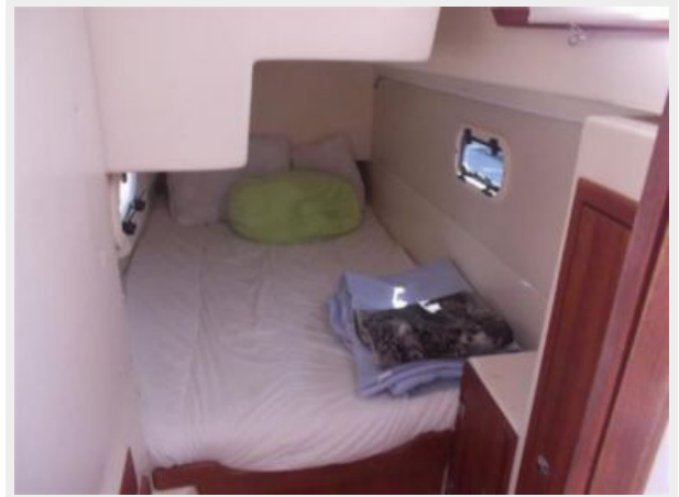
Starboard Aft Cabin