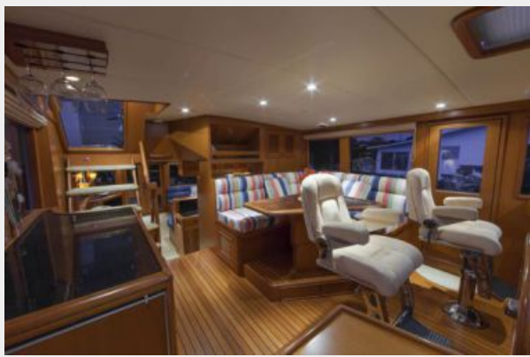
Pilothouse / Galley