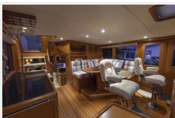
Pilothouse / Galley