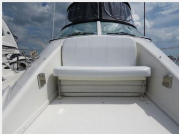
Forward Bench Seat