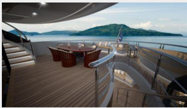
Private aft deck off skylounge