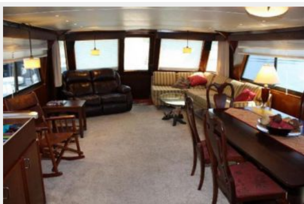
Salon looking aft