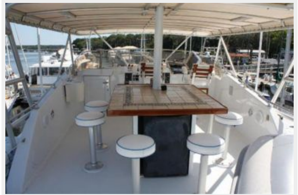
Flybridge looking forward