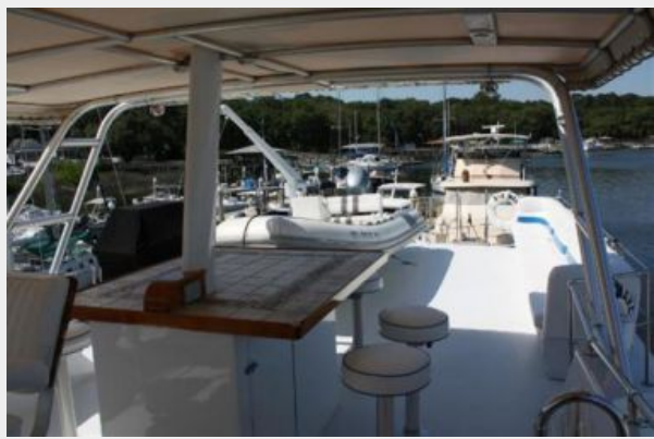
Flybridge looking aft