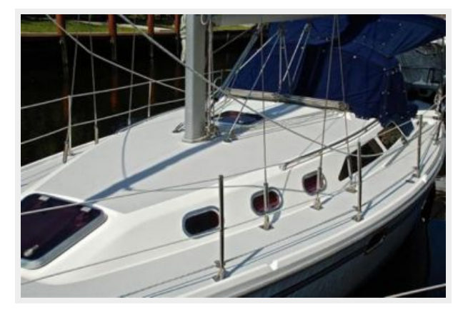
Deck Porthole Windows