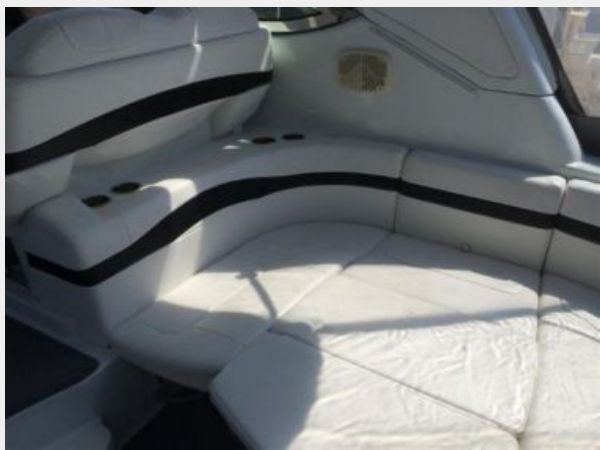
Aft Seating / Sun Pad