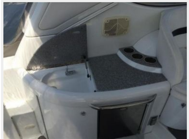
Port Wet Bar / Sink