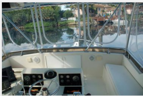
Recently new enclosure