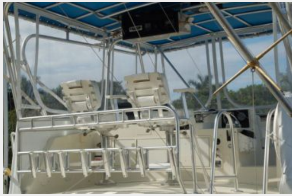
Rod holders on flybridge railing