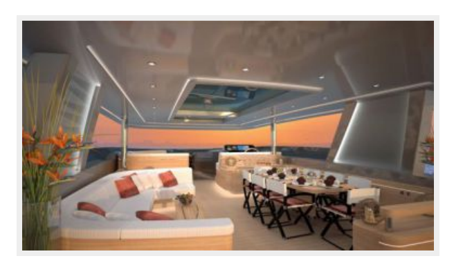
Pilothouse settee and dining area