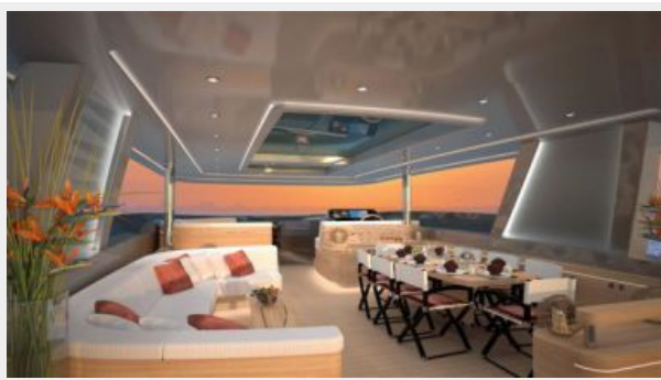
Pilothouse settee and dining area