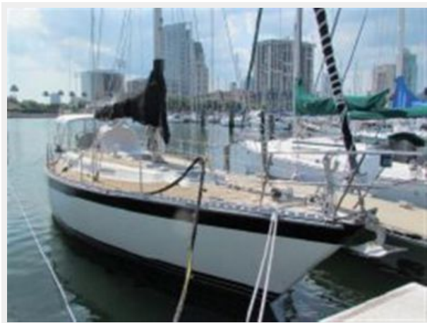
Starboard Bow Quarter