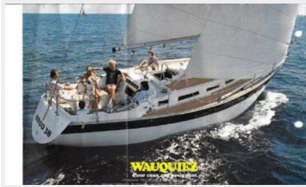
Hood 38 MK I-Brochure