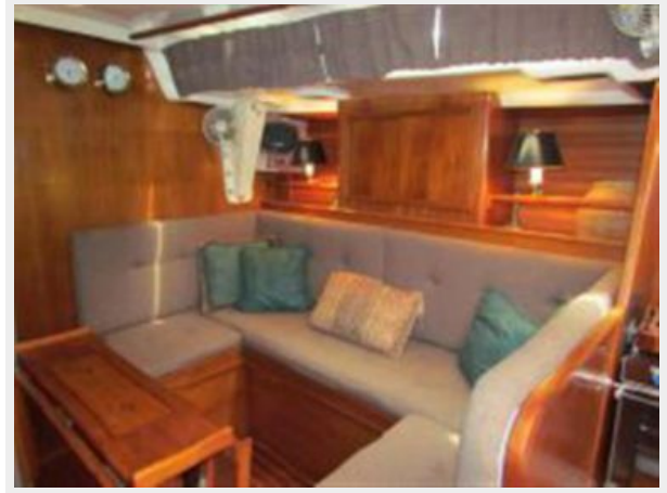
Salon Convertible Dinette-Stbd