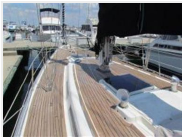
Port Deck Looking Fwd