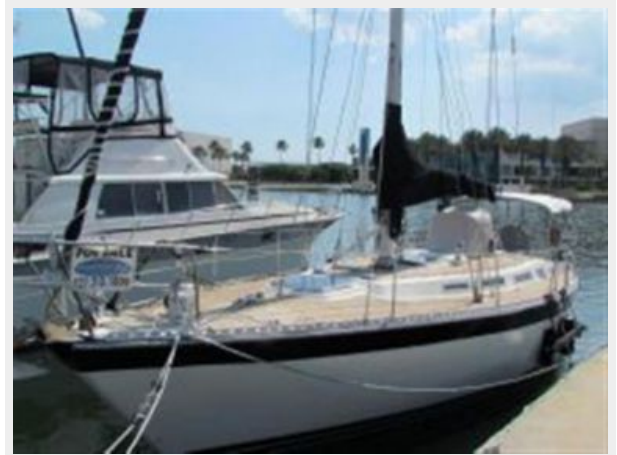
Port Bow Quarter