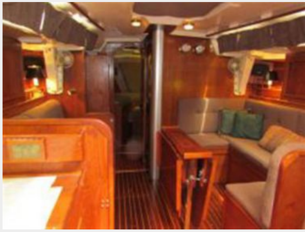
Salon Looking Fwd