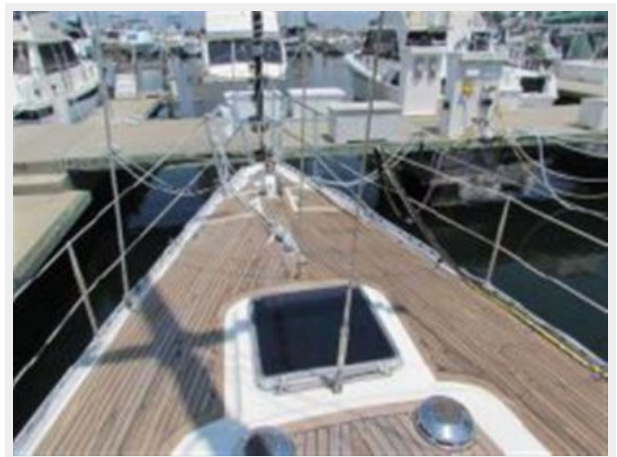
Deck Looking Fwd