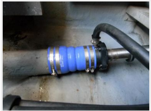
Dripless Shaft Seals