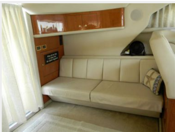
Sleeper Sofa- Port