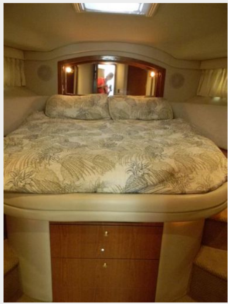
Master Stateroom Berth