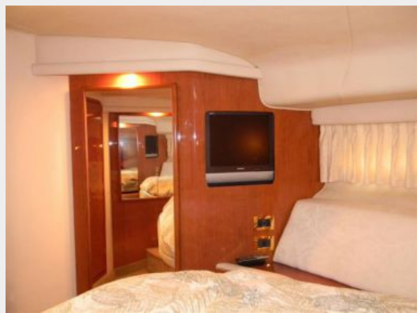
Master Stateroom TV