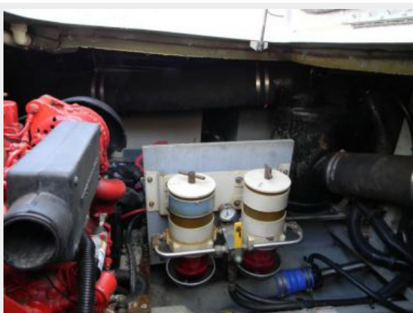
Racor Filters - Port