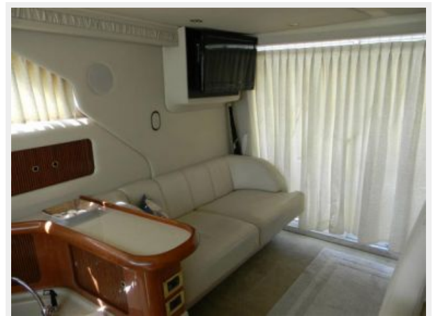
Salon Couch - Starboard