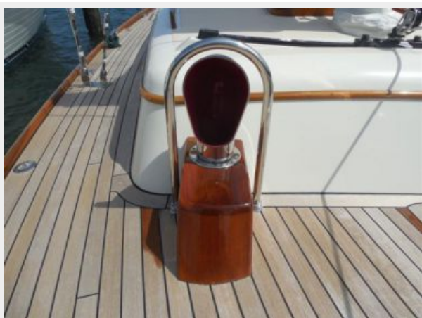
Cockpit - Bimini Secured