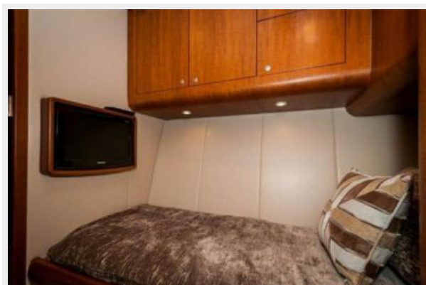
Twin Stateroom 2