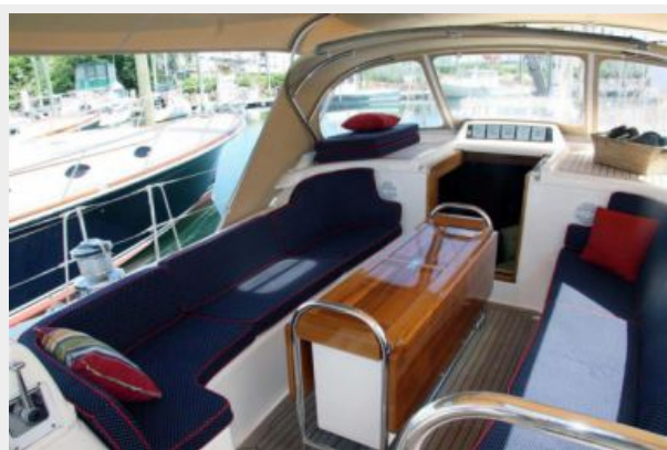
Cockpit to Port