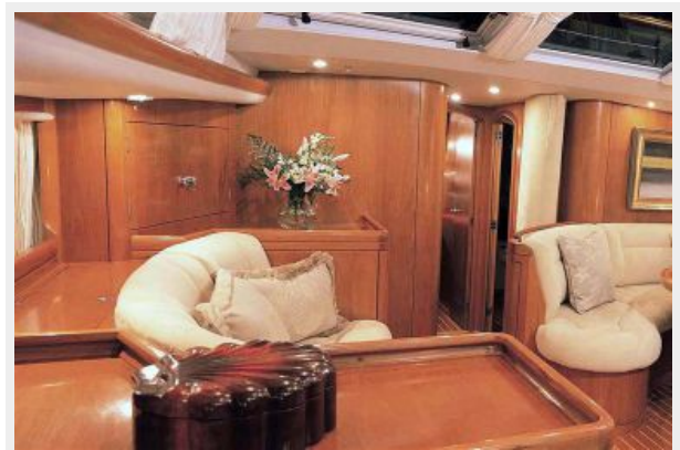
Saloon to Port