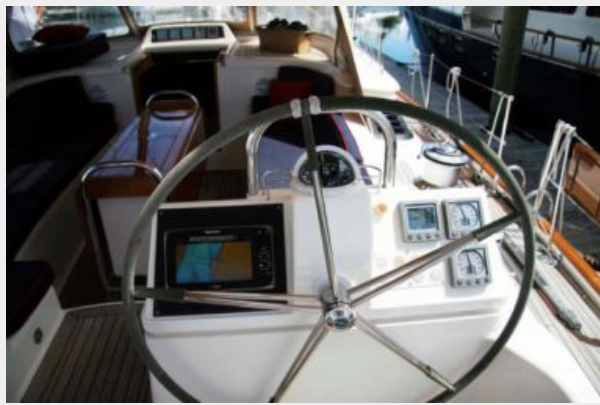
Stbd. Helm Instrumentation