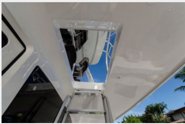
Hatch to FB