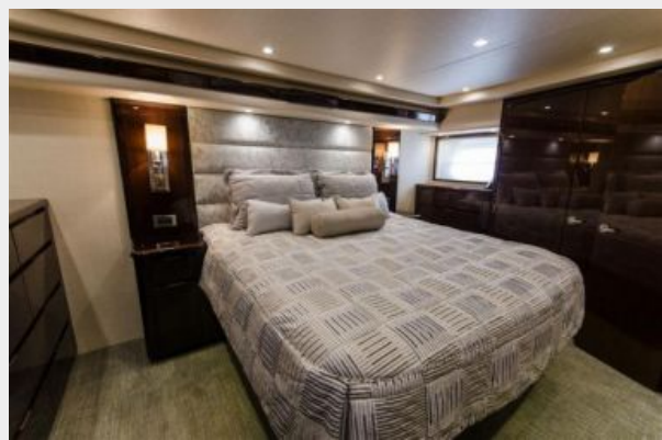
Master Stateroom 1