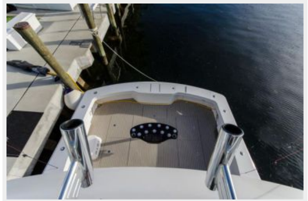
FB Looking to Cockpit