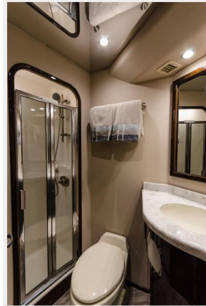
Guest Head 1