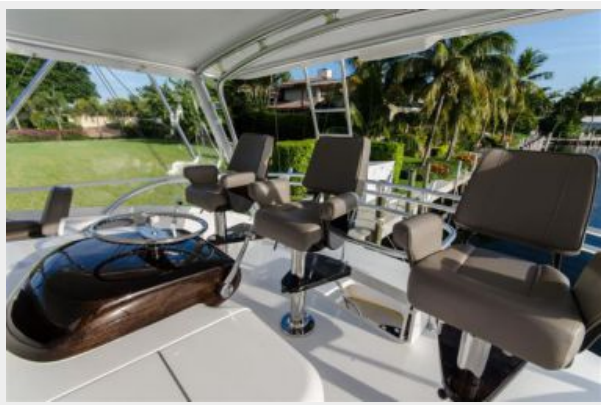
FB Helm 3