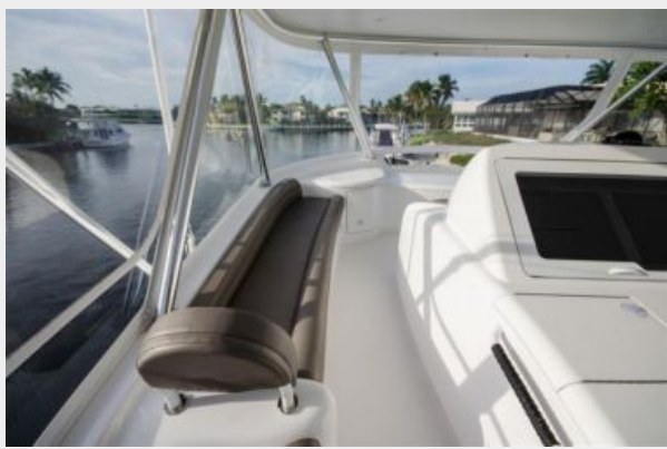
FB Seating 1