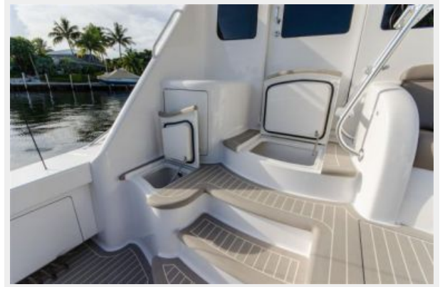
Steps to Mezzanine