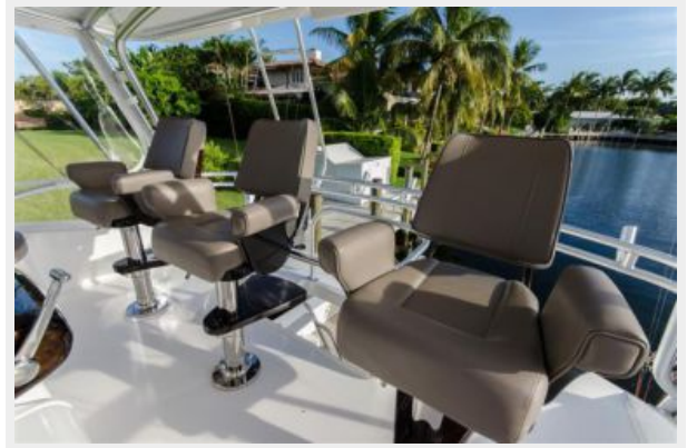
FB Helm 2