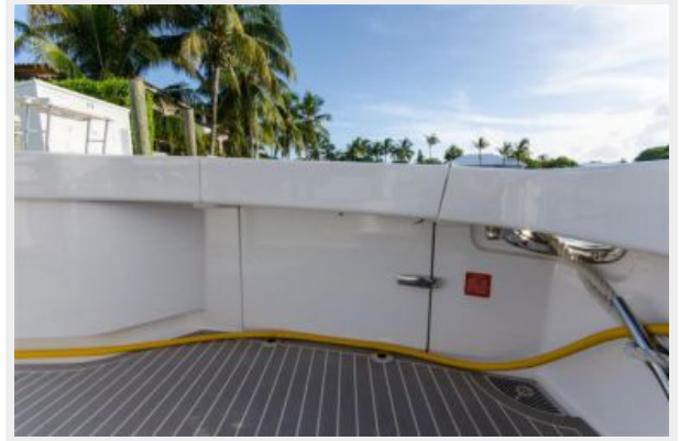
Transom Door 1