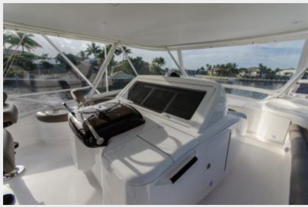
FB Helm 1