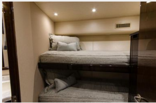
Guest Bunk Stateroom