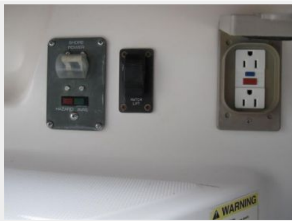
Cockpit lift and Outlet