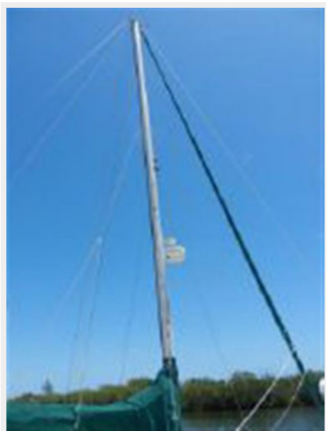
Mast and rigging, radar