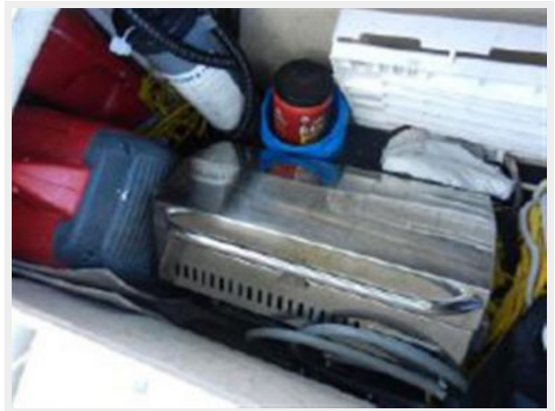
Honda generator and BBQ grill