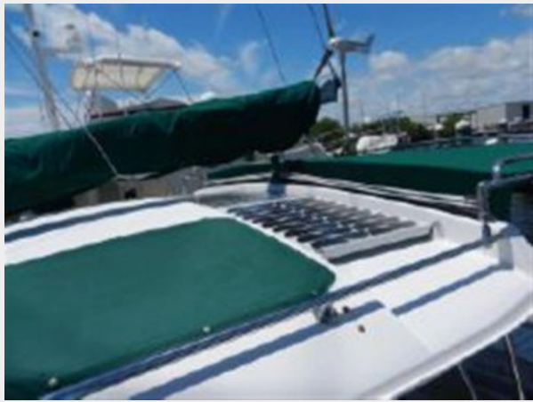
Solar and wind gen