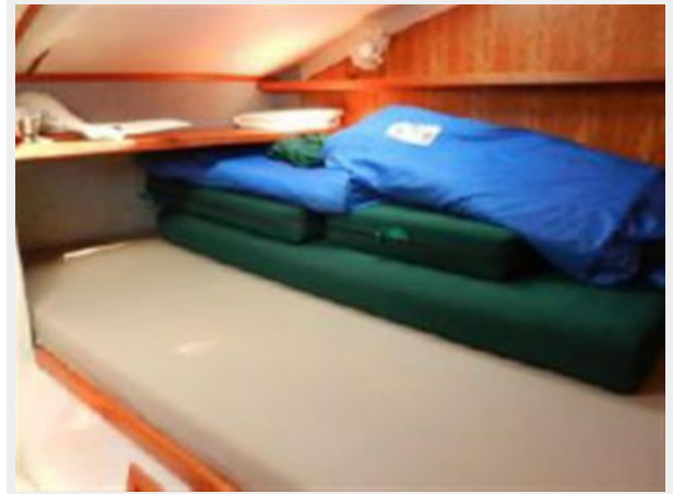
Cockpit cushions and sails