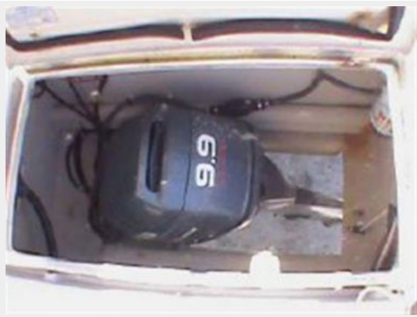
2005 Outboards, 1930 hrs