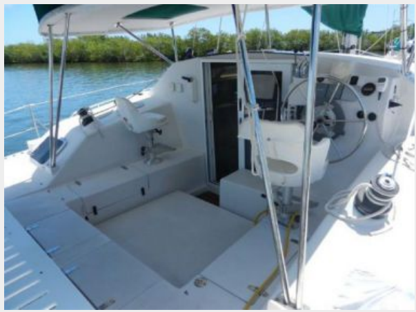
Generous cockpit seating