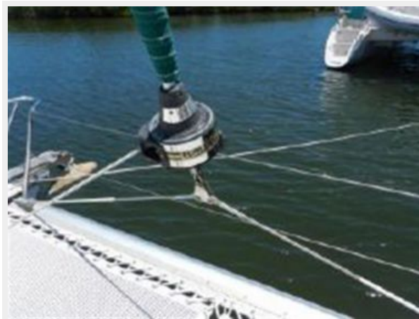
Roller furling genoa