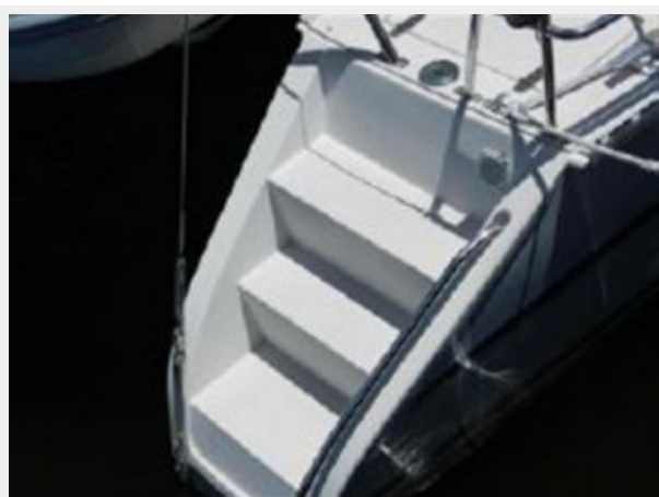
Great handholds on stern steps!