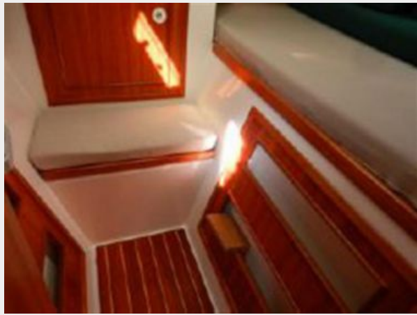
Port cabin w/double berth