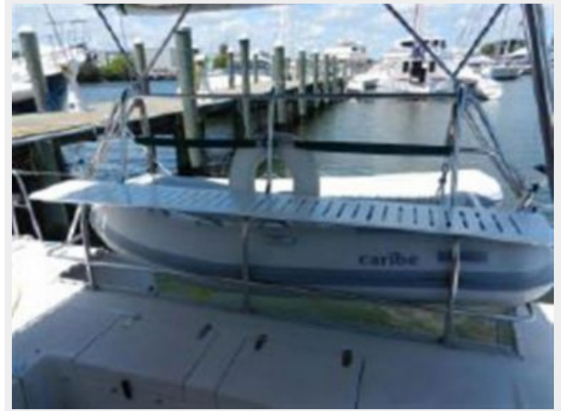
Custom stern bench seating w/ cushions