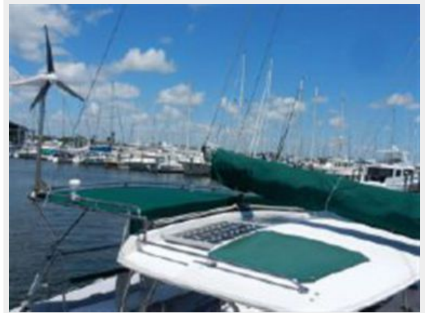
Custom shade extension beyond hardtop