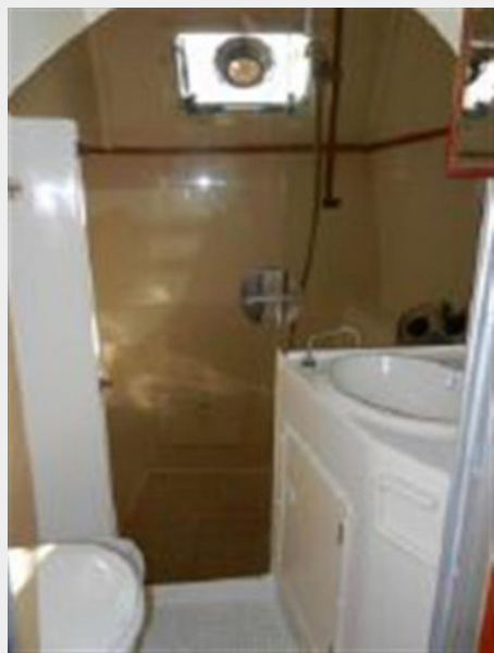
Large head and shower stall