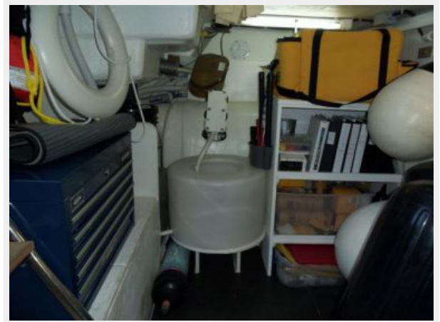
Lazarette to Port