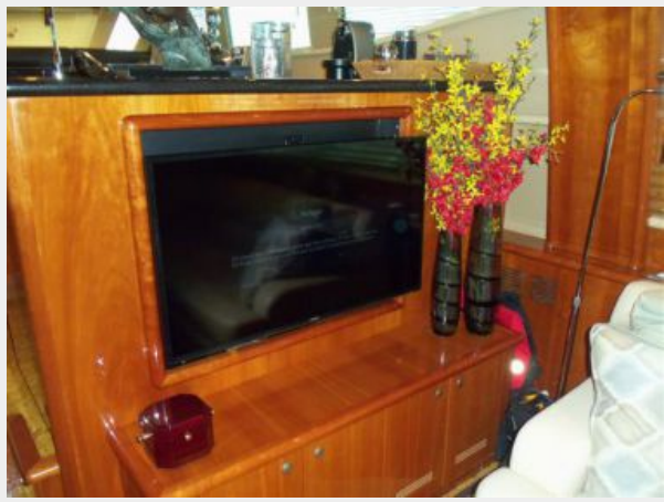
New Salon TV