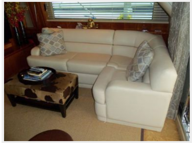
New Salon Couch to Starboard