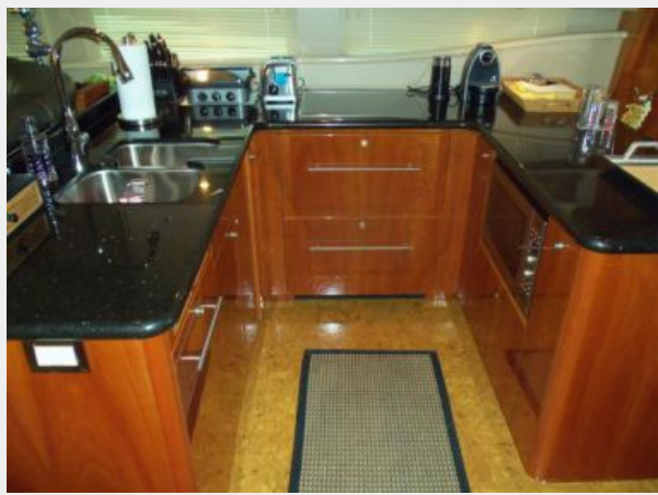
Galley to Starboard