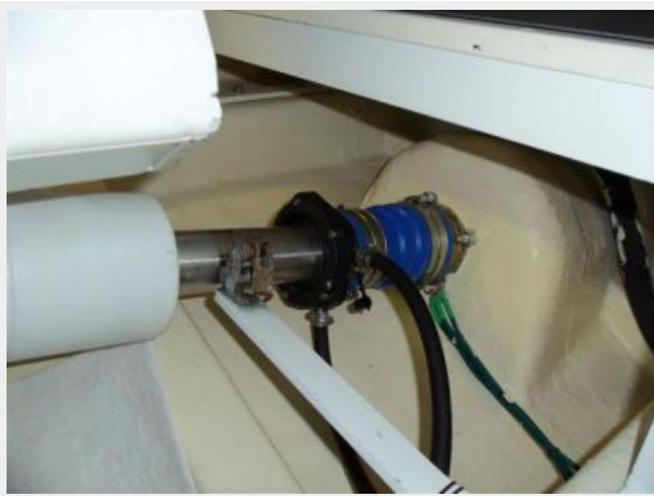
Dripless Shaft Seals