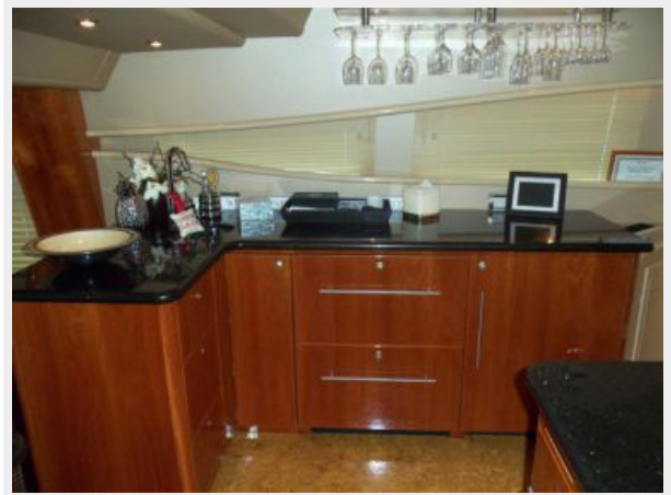
Galley to Port