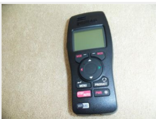
Wireless AP Remote