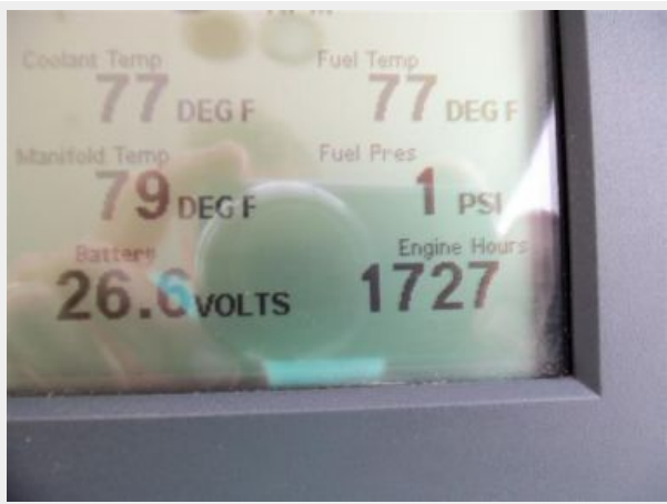
Engine Hours Feb 2, 2018