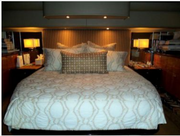
Master Looking Aft