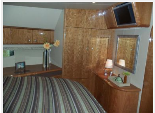
VIP Looking to Starboard