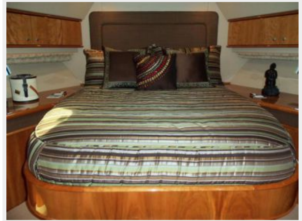
VIP Looking Forward