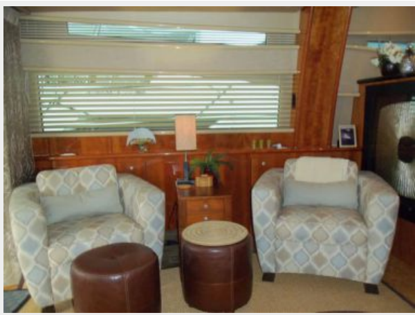
Newly Upholstered Salon Chairs to Port