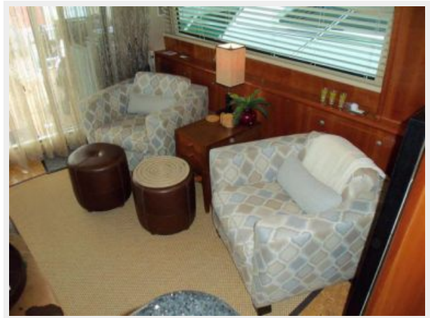
Salon Aft to Port