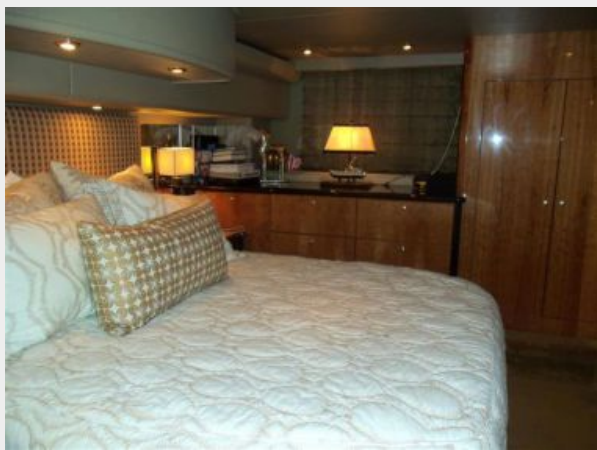
Master Looking to Port