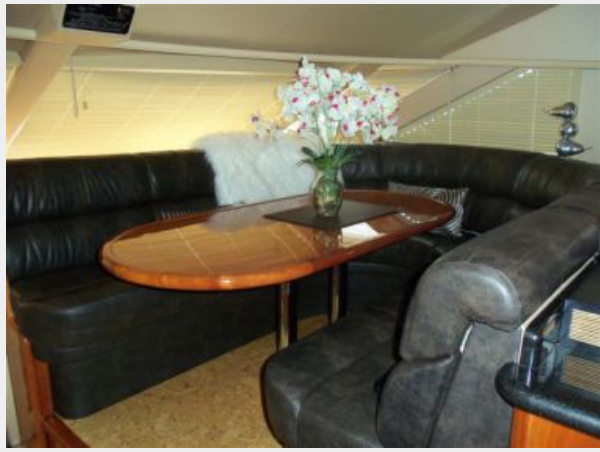
Dinette Looking Forward