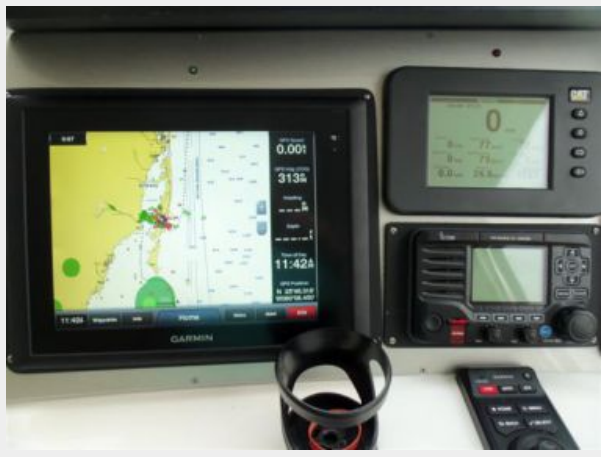
Helm Detail Port