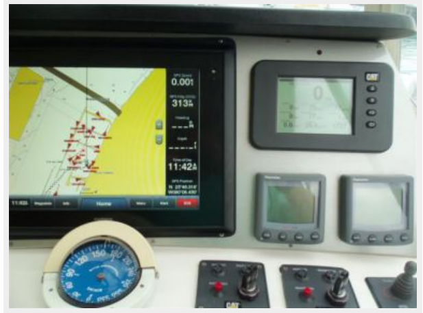
Helm Detail Starboard