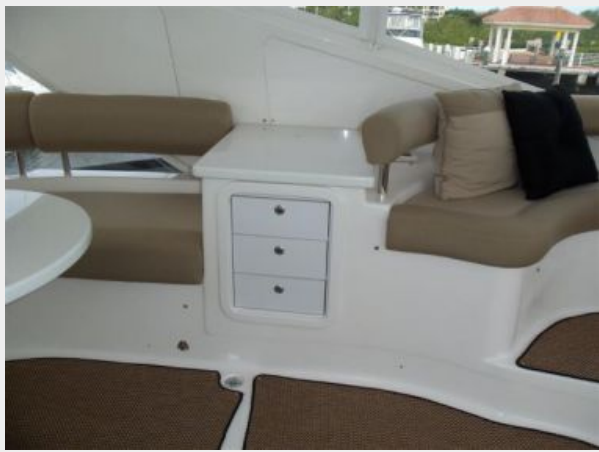
Custom Flybridge Storage