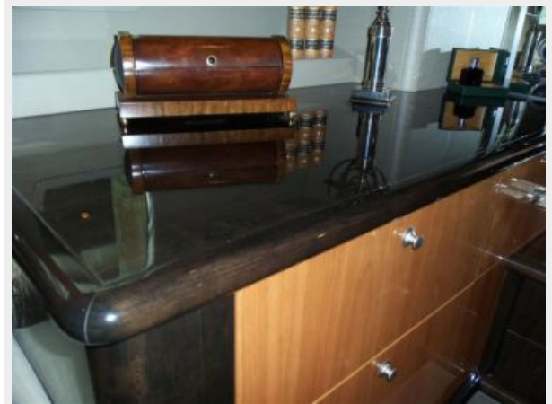
Custom Joinery in Master