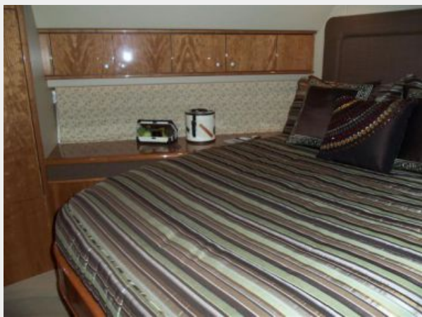
VIP Looking to Port