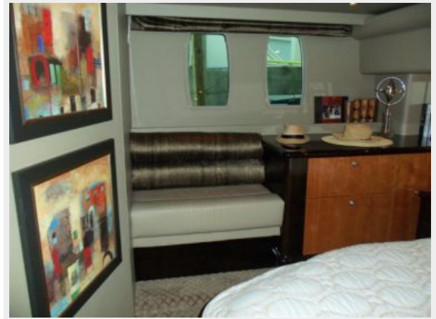
Master Looking to Starboard