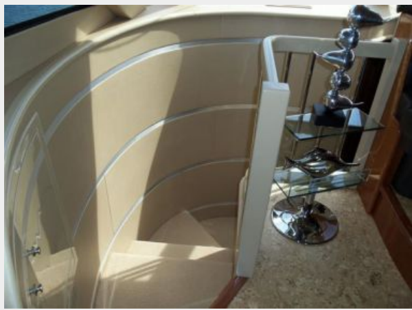
Custom Enlarged Companionway