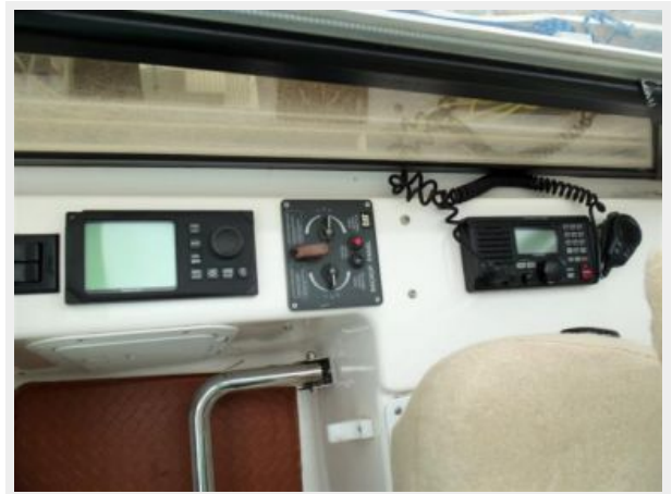
Helm Outboard to Starboard