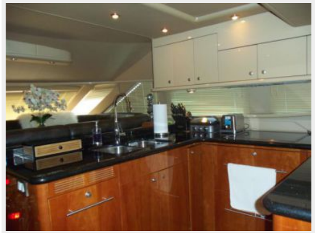
Galley Looking Forward