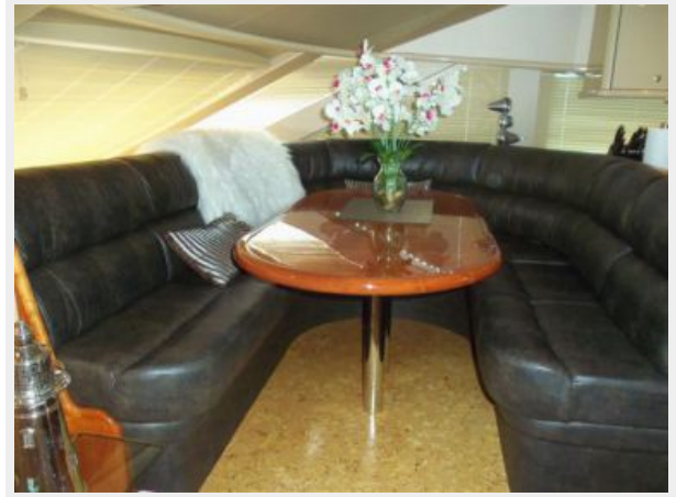
Dinette Looking to Starboard